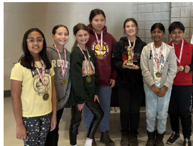
Dr. G.J. MacGillivray Public School - 2025 Finalists